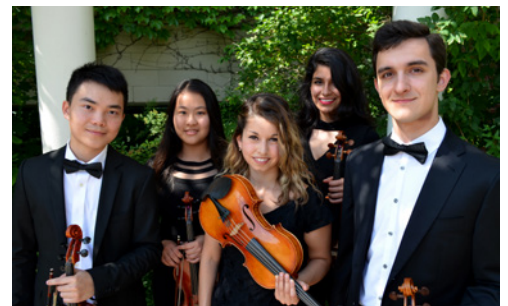
A portion of the 2017 violin section