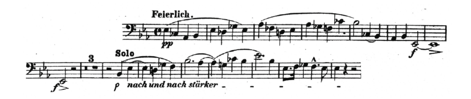
Symphony No. 3