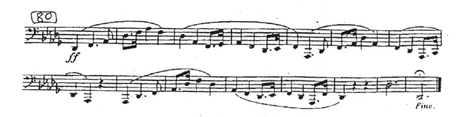
Das Rheingold, "Entry of the Gods"