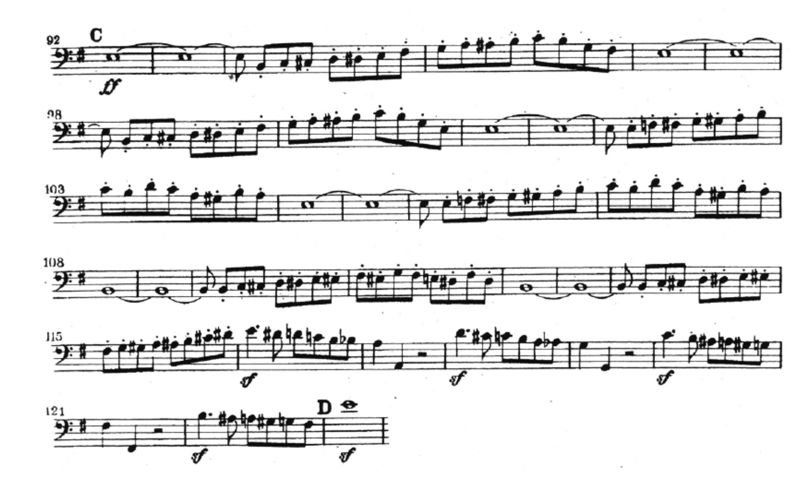
William Tell Overture